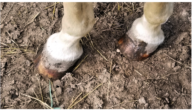
All four feet in order to show hoof health and maintenance.